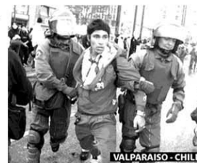
VALPARAISO - CHILI